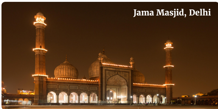
Jama Masjid, Delhi

Day 2 – Arrive at Delhi airport • Clear immigration and customs and meet your courier(s) • Transfer by coach to the hotel and check-in • Welcome and tour briefing at the hotel with your courier(s) • Dinner in the hotel