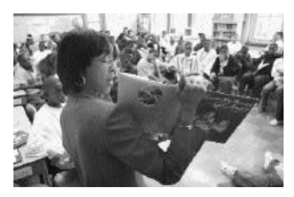
On October 4 and 5, author and NPR commentator Bebe Moore Campbell visits eight classes in the three Near North Magnet Cluster schools in Cabrini-Green, reading from and discussing her boometimes My Mommy Gets Angry. She also speaks with children in Tutoring's Kids Cafe and addresses a Michigan Avenue Forum on the topic of adult mental illness and its effects on children.