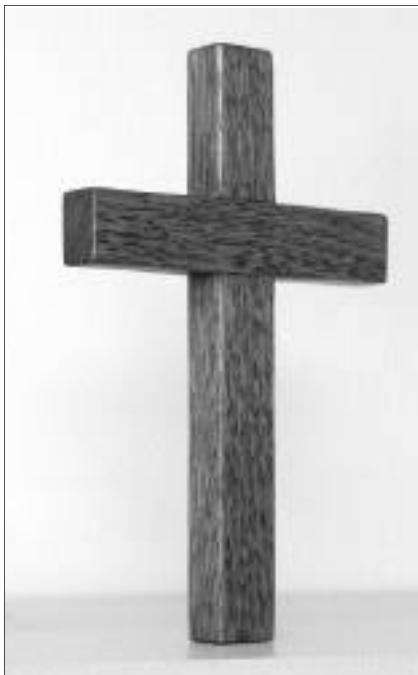
Crosses made from the original pews