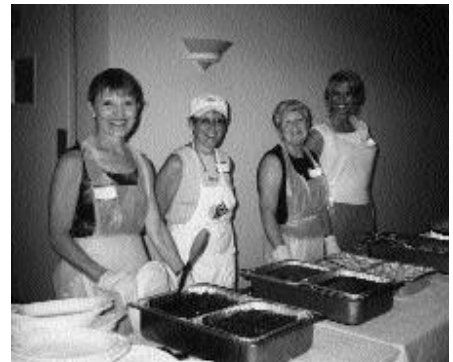
In March, Deacon leaders and other volunteers, including Fourth Church youth groups and members of Congregation Kol Ami, begin serving a weekly Monday-evening meal to 110 to 125 low-income neighbors.