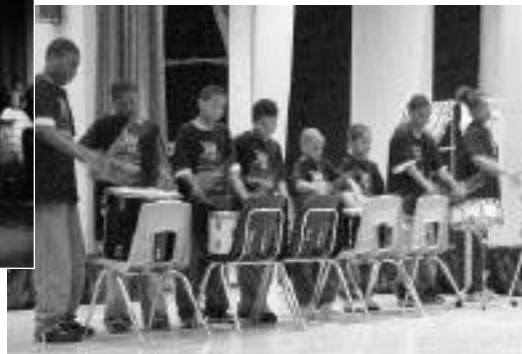
In May more than 750 students, community members, and Fourth Church friends attend one of three lively performances of the fourth annual Festival of the Heart, “The Wiz that Wuz,” which is put on by 125 student performers from the Near North Magnet Cluster schools. An additional performance will be added in 2005 to accommodate the growing audience.