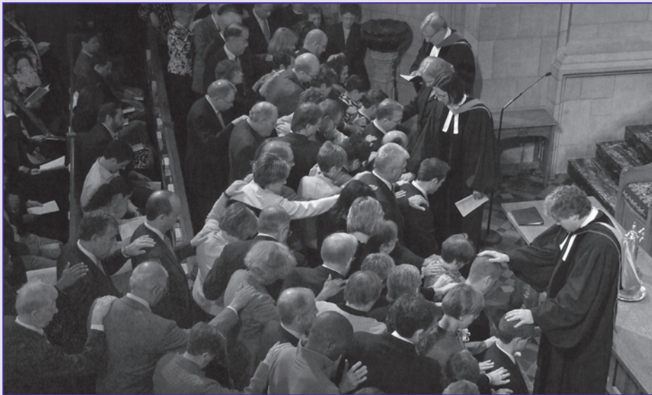
Officers elected at the February 22, 2009, Annual Meeting of the Congregation are ordained and installed during worship on May 17, 2009.